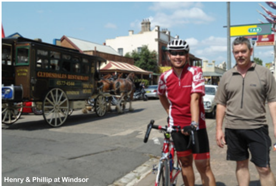
Henry & Phillip at Windsor