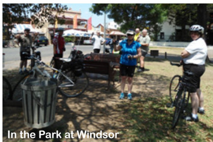
In the Park at Windsor